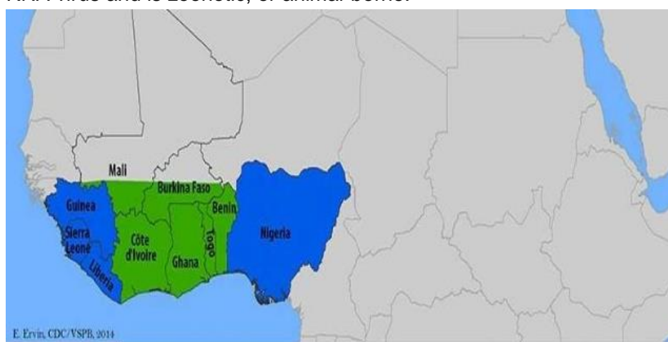
LASSA FEVER DISTRIBUTION MAP

Lassa fever is an acute viral illness that occurs in West Africa. The illness was discovered in 1969 when two missionary nurses died in Nigeria, West Africa. The cause of the illness was found to be Lassa virus, named after the town in Nigeria where the first cases originated. The virus, a member of the virus family Arenaviridae, is a single-stranded RNA virus and is zoonotic, or animal-borne.